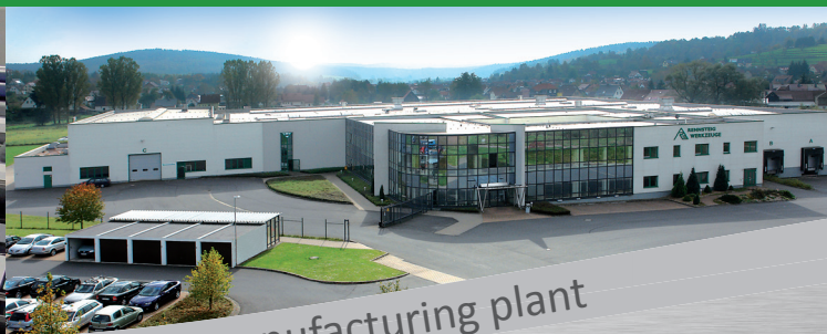
German manufacturing plant