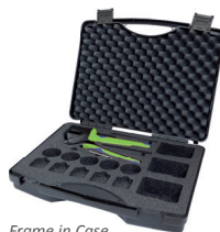
Frame in Case