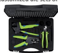
Case for Crimp System Tool, Insulation Stripper, Cable Cutter, Die Sets, Locators